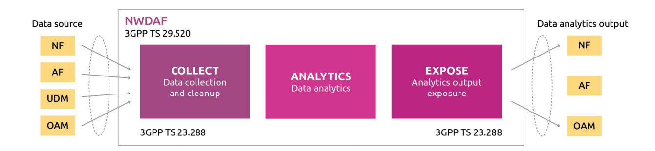
Figure 1: Capgemini Engineering NWDAF high-level architecture

By leveraging NWDAF, the service provider can seamlessly monitor multi-vendor 5G network and proactively take mitigative action if the analytics output predicts a failure or network issue. It will improve the end user's 5G service experience and enhance their stickiness with the service provider.